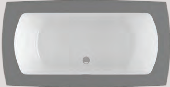
MONARCH 6938C CURVED DECK – ALL SIDES