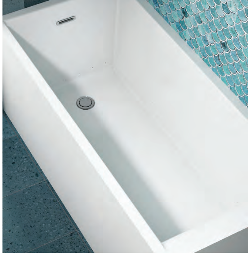
NOKORI 5827 (FREESTANDING)